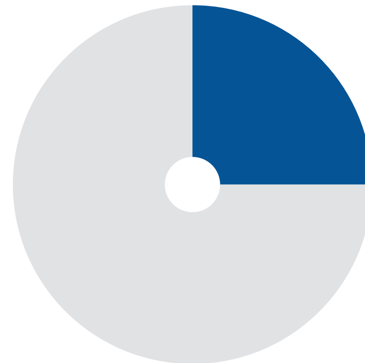
25% WORRY POOR SCHOOLS HURT BUSINESS'S ABILITY TO COMPETE