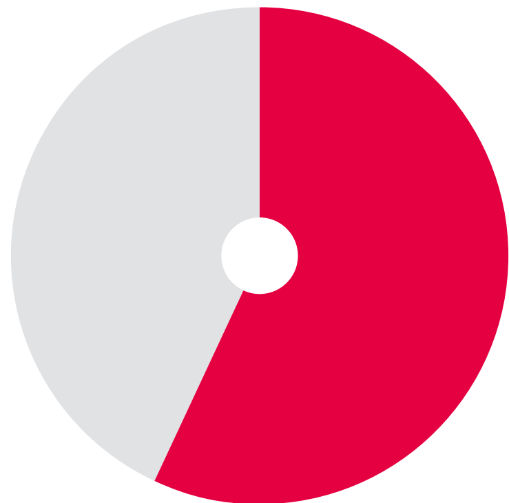
57% BELIEVE OUR SCHOOLS ARE ON THE WRONG TRACK